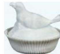
2004 Bird with Berry