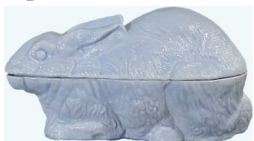
Atterbury-type Blue Rabbit - 9"