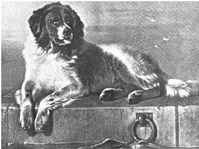
A DISTINGUISHED MEMBER OF THE HUMANE SOCIETY — Landseer London, England

In the ON, Sept., 98:15,23, I wrote an article about "Boatswain and Barry," the English mantel dog & the Vallerysthal St. Bernard, calling attention to the English dog as a Newfoundland Dog and connected to the famous English painter (of dogs) Sir Edwin Landseer. See Ebay 400167069724.