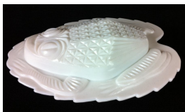
White Flat Frog—8 1/4"